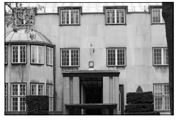
Stoclet Palace façade detail

The Stoclet Palace in Brussels has been added to UNESCO's roster of World Heritage Sites. The building was designed in 1905 by Austrian architect Josef Hoffmann for banker and collector Adolphe Stoclet. It is considered an icon of the Viennese Secessionist Movement and an important milestone in the history of European architecture. UNESCO states that "...[its] austere geometry marked a turning point in Art Nouveau, foreshadowing Art Deco and the Modern Movement in architecture."